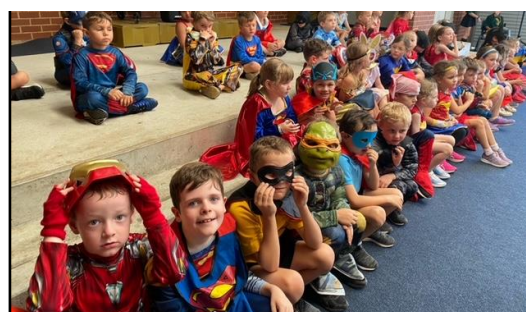
Year 1 & 1/2 class assembly