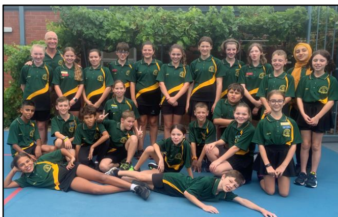
Year 6 Leavers Shirts – looking good!!

Part of our parent survey results last year indicated that the community would like to know what the staff are learning, as well as the students. Currently the staff have already commenced an Autism Professional Learning which will be run over 4 sessions. Session 2 will be held on 11th May.