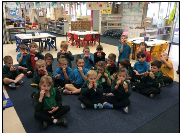
Pre Primary and Kindy Students making a "Crocodile Crunch"

On Friday 6 th September, the school took part in the Great Aussie Crunch. Herne Hill Primary School is an official Crunch & Sip school and this was a fun way to eat something crunchy and healthy. Well done to all who participated.