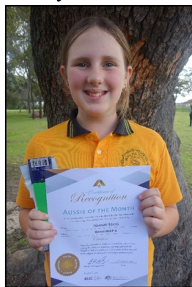
Star Reader Awards