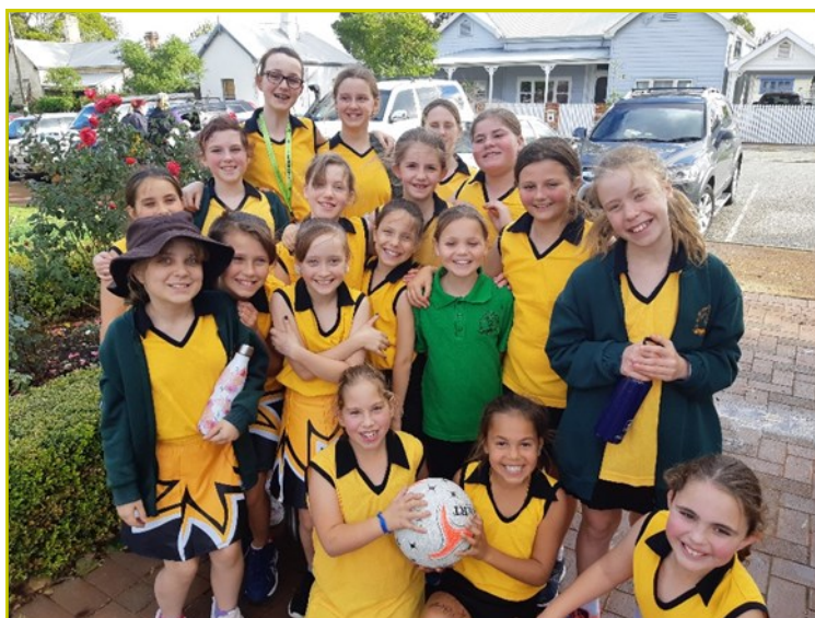
Our Interschool netballers

Thank you to all those who responded to our Uniform Polo Shirt Survey. Parents, students and teachers have now all had an opportunity to provide feedback that will guide the Uniform Committee's decisions going forward. We will keep the school community updated with developments as they happen.