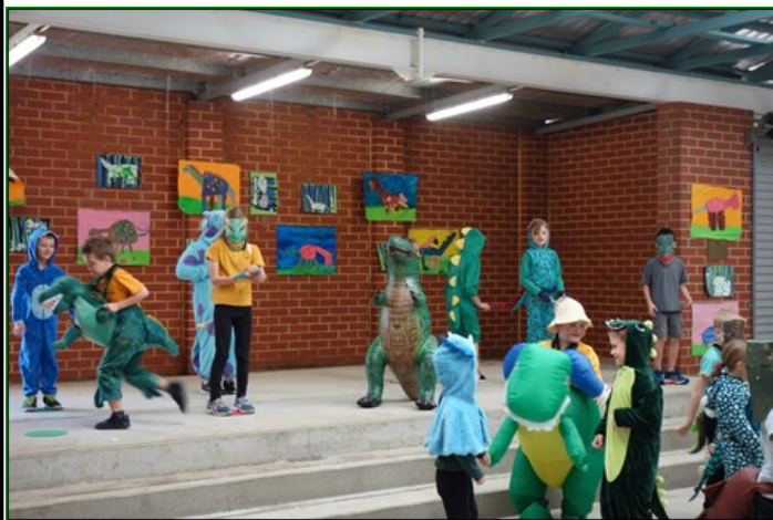
Year 1 & 2 Assembly item was a hit with everyone