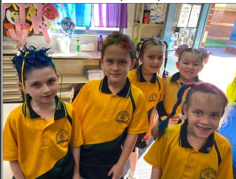
Year 2 Crazy Hair Day

Crazy Hair Day for a gold coin donation was a huge success. I was amazed with the creativity of the hairstyles! We raised over $200 which was to cover the cost of the Jump Jam Team entry into the competition next term.